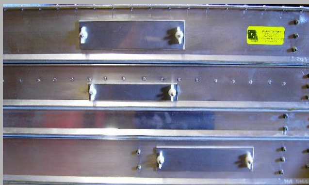
CS-1 inspection portholes with the cover plates & wing nuts installed.

The cost of the inspection portholes is $200.00 per deck added to the cost of a new deck or to the cost of deck repair. Included is: (1) front side port hole with cover plate and self-adhering gasketing, (1) rear side porthole with cover plate and self-adhering gasketing & (4) nylon wing nuts.